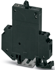
Thermomagnetic circuit breaker, 1-pos., fast blow, 1 N/C contact, with universal foot for mounting on NS 32 or NS 35

Please be informed that the data shown in this PDF Document is generated from our Online Catalog. Please find the complete data in the user's documentation. Our General Terms of Use for Downloads are valid ( http://phoenixcontact.com/download )